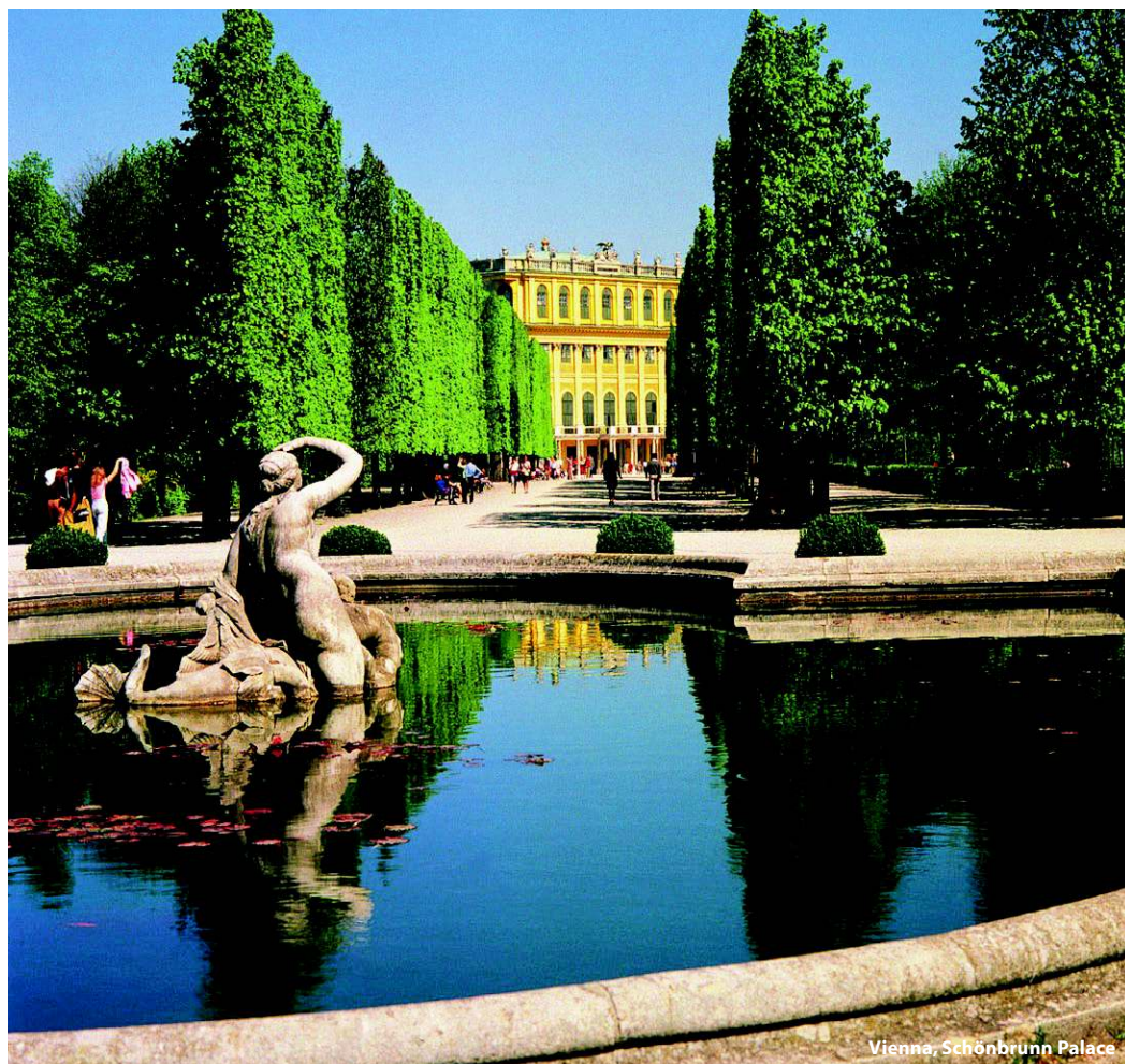
Vienna, Schönbrunn Palace