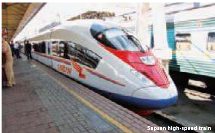
Sapsan high-speed train