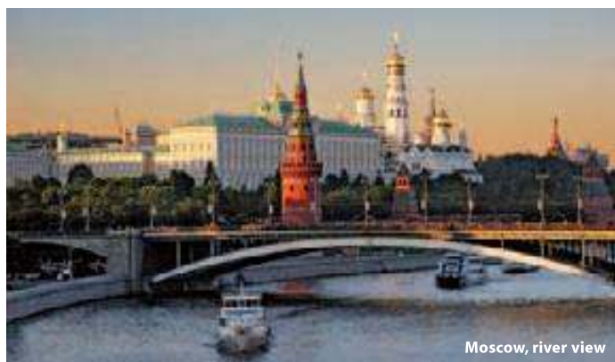
Moscow, river view

Full day trip to Suzdal, one of the prettiest and best preserved of the Golden Ring towns. You will see Suzdal, Vladimir, the Museum of open-air Architecture and enjoy a relaxing lunch. Daily.