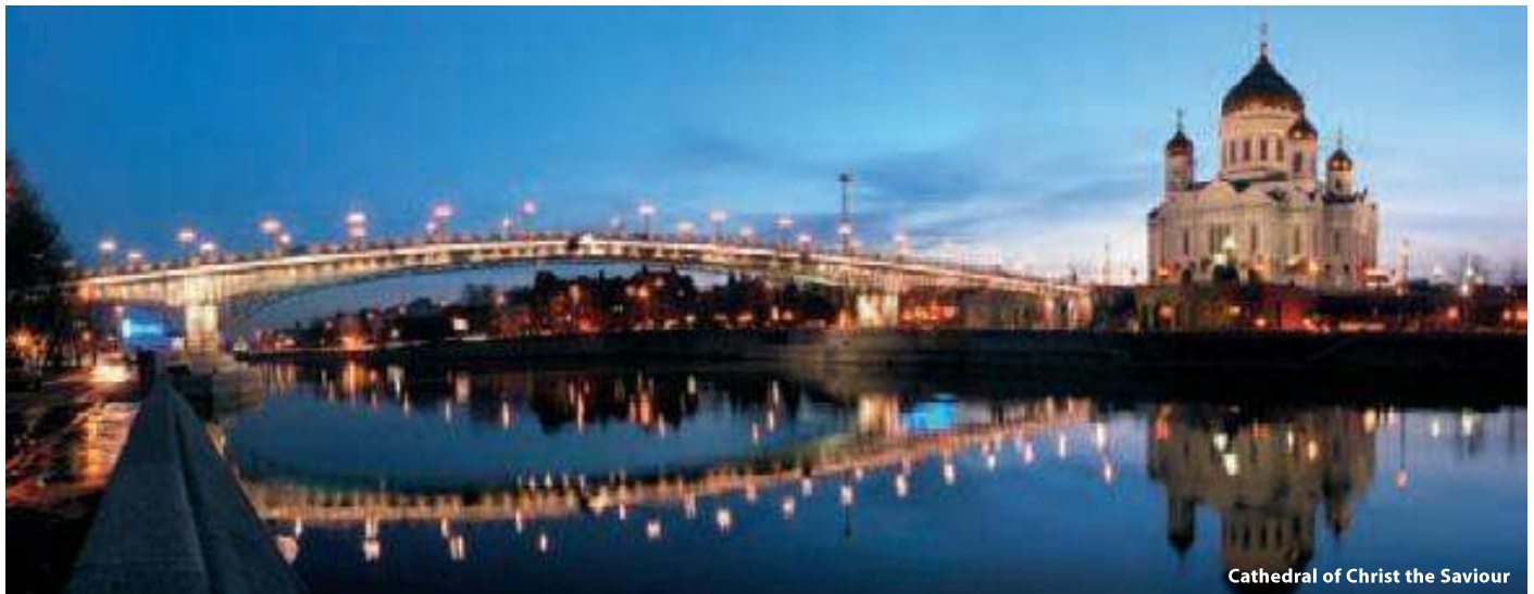
Cathedral of Christ the Saviour