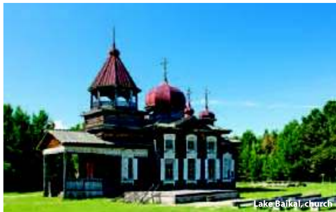
Lake Baikal, church

Ekaterinburg is the historic and the administrative centre of the Urals. Tsar Nicholas II and his family spent their last days here. They were executed soon after