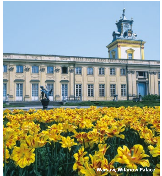
Warsaw, Wilanow Palace

Ul. Krakowskie Przedmieście 42/44 Elegant, famous deluxe hotel overlooking the Presidential Palace in a very central location. 205 rooms in traditional style with A/C, Sat-TV, safe, minibar, internet. Restaurant, café, fitness centre, indoor pool.