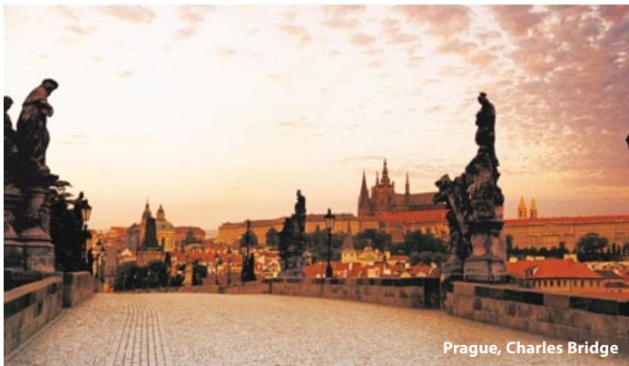
Prague, Charles Bridge