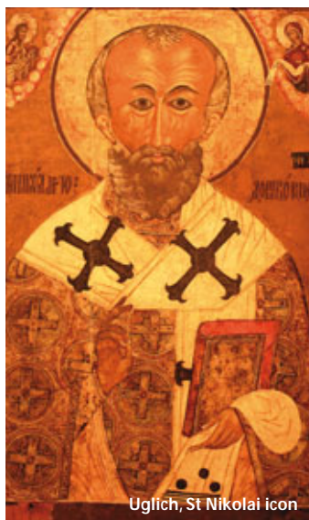
Uglich, St Nikolai icon