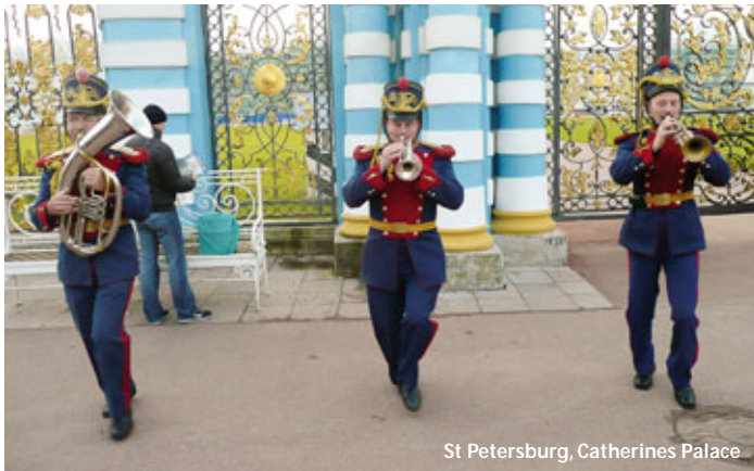
St Petersburg, Catherines Palace